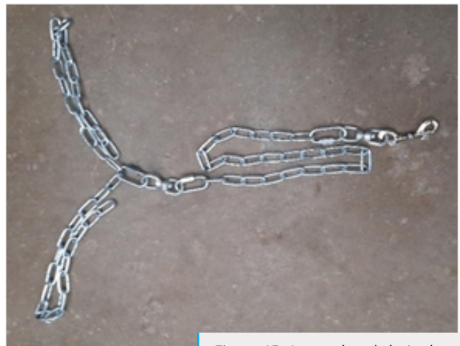
Figure 15. A completed chain drag.