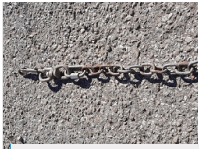
Figure 11. A chain with two quick links and swivel attached.