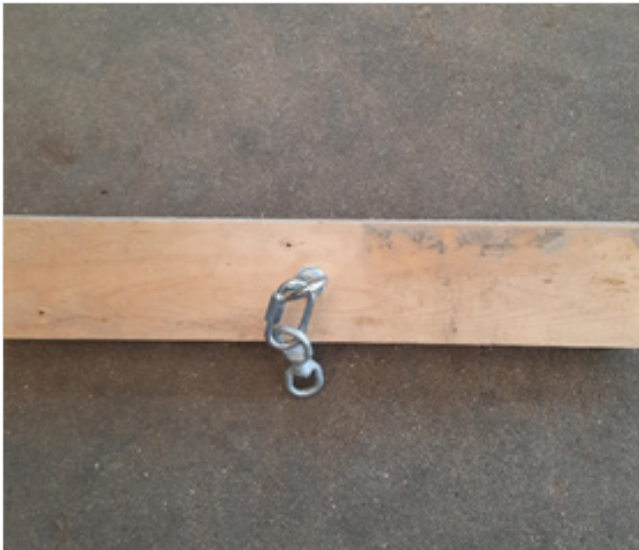
Figure 5. An attached quick link and swivel tightened to the eye-bolt loop.