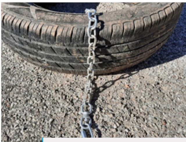
Figure 10. A tire drag with quick link and swivel.