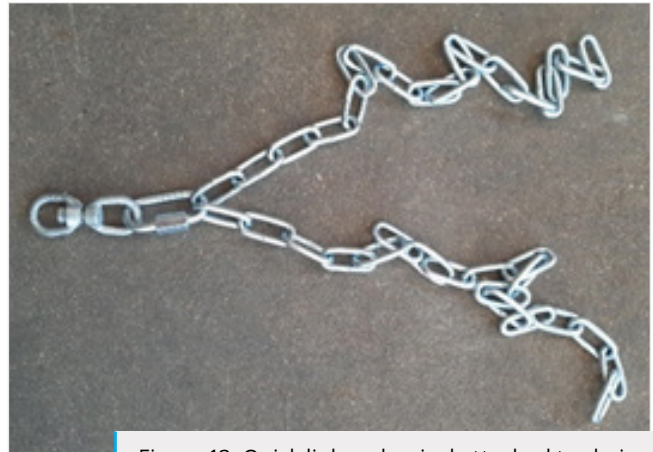
Figure 13. Quick link and swivel attached to chains.