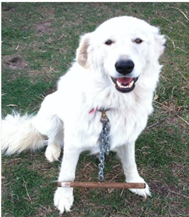
Figure 1. Livestock guardian dog (LGD) wearing a wooden dangle stick.

Chasing young livestock and biting the legs of livestock is a common problem in young livestock guardian dogs (LGDs). Sheep and goats can be crippled, and possibly die due to injuries associated with bites from young LGDs.