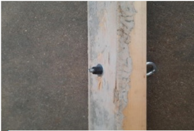
Figure 2. A dangle stick. Note: Lock nut on eye-bolt to keep the board secure on the chain.

It is also important to use an eye-bolt and not an eye-screw (especially in wood) to attach the swivel and chain (Fig. 2). An eye-screw will eventually unwind itself out of the piece of wood. Make sure to use a lock nut on the end of the eye-bolt so that it does not come undone.