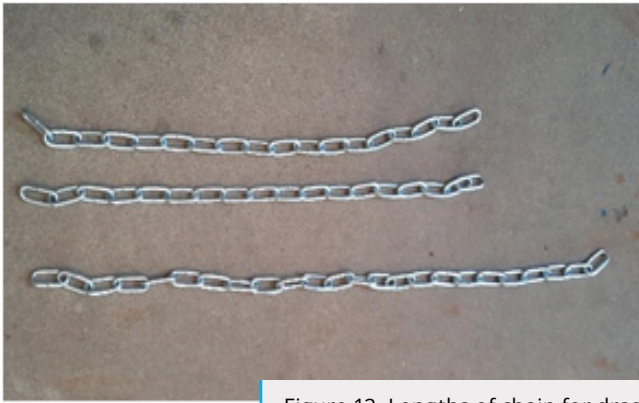
Figure 12. Lengths of chain for drag.