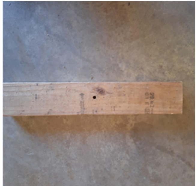
Figure 3. The location to drill a hole for the eye-bolt, which is slightly larger than the diameter of it.