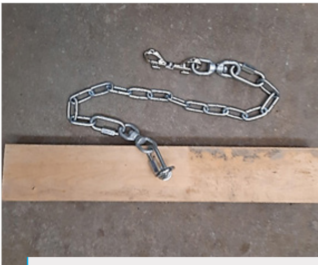
Figure 6. After attaching the chain to the last quick link, leave the quick link loose until the correct height for the dangle on the LGD is determined.