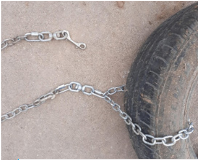
Figure 8. Tire drag with swivels at each end of the chain.