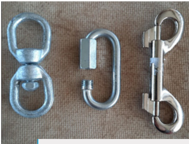
Figure 9. Swivel, quick link, and double-end snap.