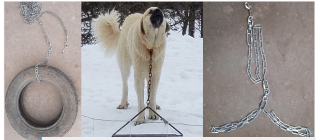
Figure 7. Different types of drags for LGDs.