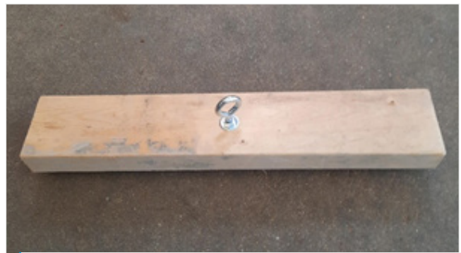
Figure 4. Example of a standard threaded eye-bolt with flat washers on both sides.